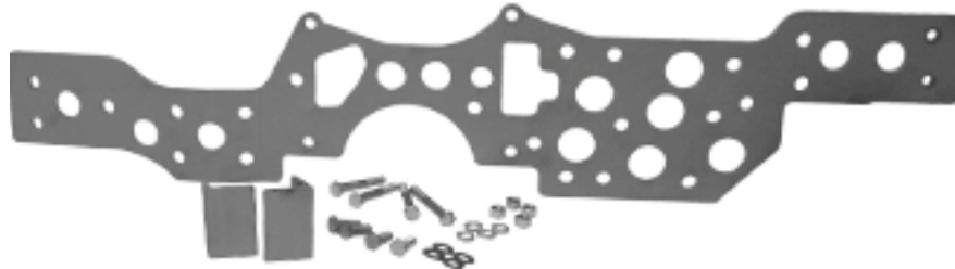
C Front Motor Plate F-Body Kit