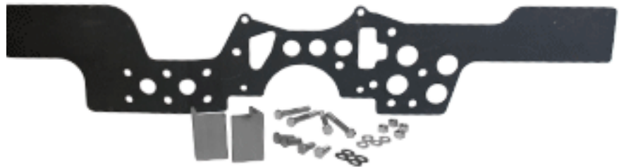
B Front Motor Plate A-Body Kit