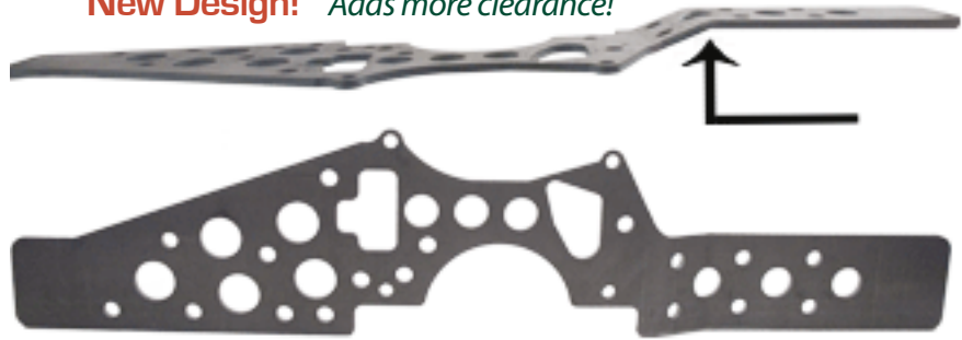
A Front Motor Plate