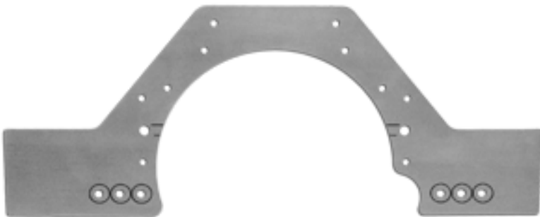
AllPontiac Mid Plate E