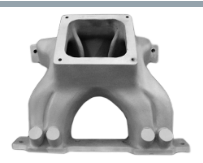
A AllPontiac Tiger Intake Manifold (pic 1)