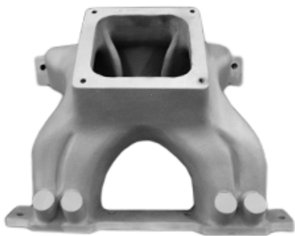
A AllPontiac Tiger Intake Manifold (pic 1)